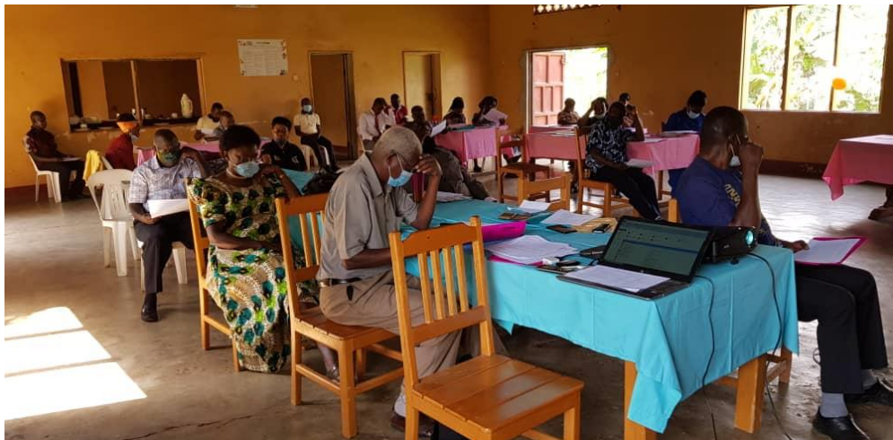
In the pictures are some of the guests who participated in the just concluded AGM.

Among the activities that dominated this meeting were approval of the various reports from the Board Chairman, Director, Audited report and approval of the 2021 work plan and Budget.