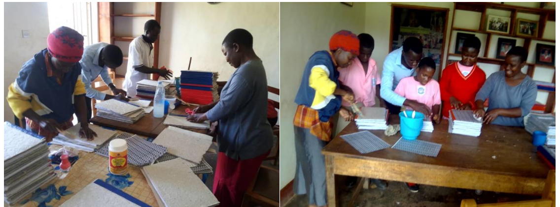
The staff and children during the book making training

Our staff were taken through another phase of book making training which lasted for 2 days. The purpose of these trainings is to empower the staff with skills to be able to manufacture books and perhaps cut on the cost of having to buy them from the open market expensively.