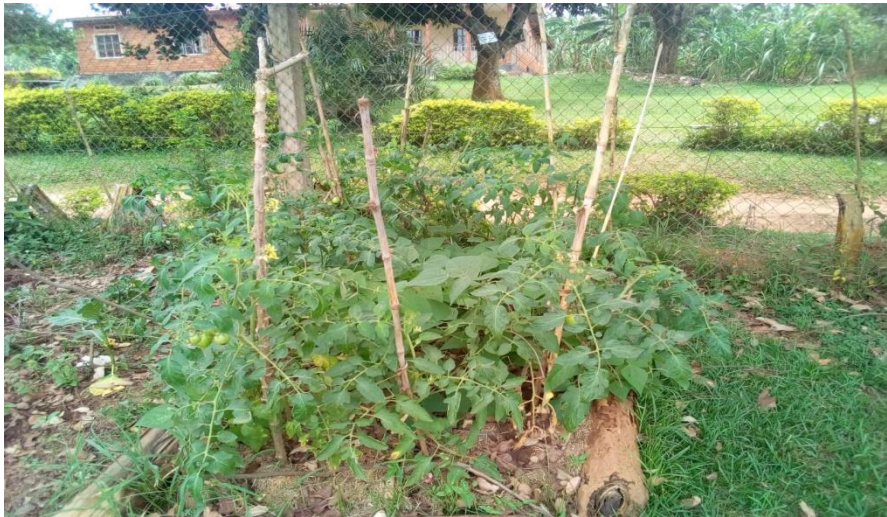
In the pictures are sections of some of the vegetable gardens around CSU compound

The staff working with the children have accelerated vegetable planting around CSU compound and in gardens. Among the items planted are the heat resistant vegetable varieties like tomatoes, onions and cabalas