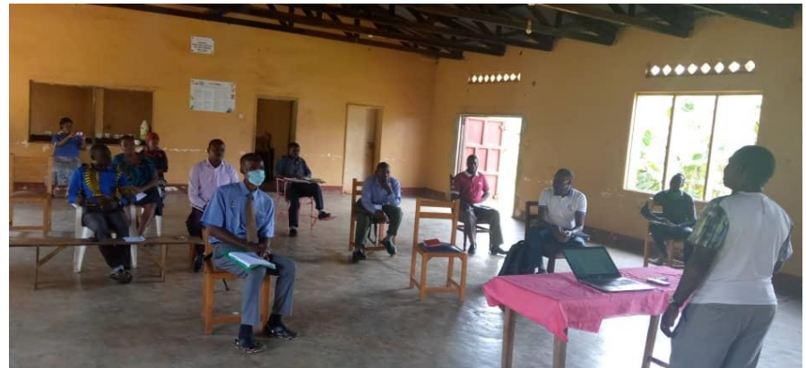
Members of CSU board and Staff during one of the meetings.

Several meetings have been held this month among which included the Board and the AGM plus the weekly staff meetings. In these meetings, members discussed issues regarding the successful implementation of the Ministry of gender standard operating procedures during this Covid-19 new normal