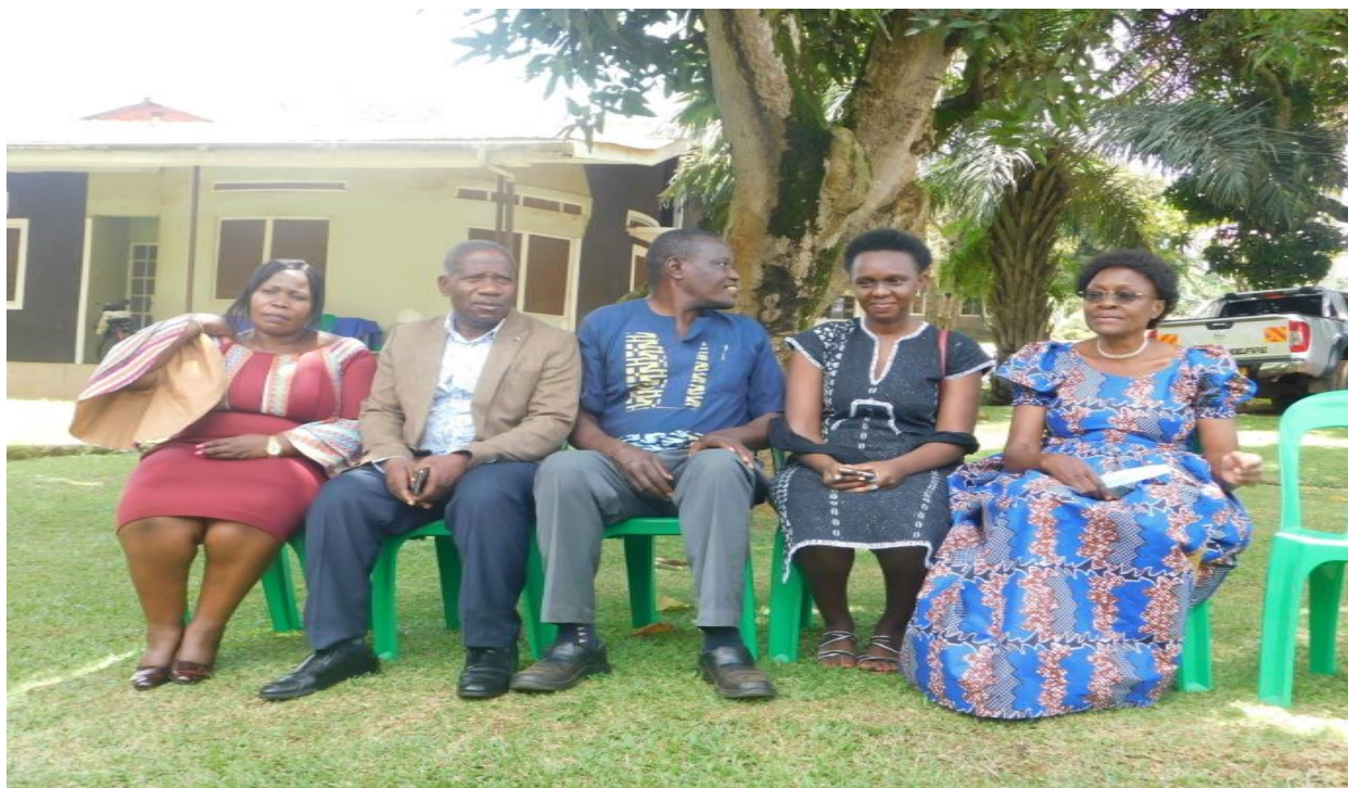
In the pictures above are some of the members who attended the AGM and below is the new Management board